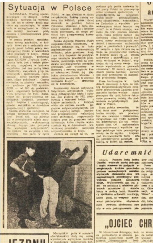
Photo 1. A page of the daily Czerwony Sztandar (Issue of 3 September 1980): in the photo – a US police officer arrests a black man, and the title of the adjacent top article: “Situation in Poland”.