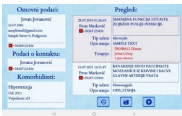
Figure 1. PCC service for stroke outpatient rehabilitation: Module for doctors

Developed PCC services support identified features in outpatient rehabilitation business process model developed in [2]. It is implemented in the form of mobile application for patients (connected with external devices, like smart phones, etc.) and web/mobile application for doctors supporting detailed view on rehabilitation process of patients, definition of corrective measures (highly relevant for exercises for motoric rehabilitation, pain reduction medications, etc.) (currently available on Montenegrin language) (Fig.1., Fig.2.). Specific module for prediction of the rehabilitation process, as well as for prediction of recurrent strokes for each specific patient is developed. The predictive system is developed by using existing databases and stroke patient registries [1][2], while it is expected to increase the accuracy by exploring data collected by active system usage.