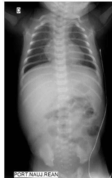
Figure 3. X-ray before operation showing no signs of perforation

Emergency laparotomy was done with high suspicion of perforated necrotizing enterocolitis. A fibrin infiltrated bowel was found adherent to liver edge with a lot of purulent matter. At the center of the infiltrate a gangrenous appendix was found, and appendectomy with peritoneal lavage was performed. Postoperative period was unremarkable, and the newborn was discharged after 16 days of admission. Histopathological report confirmed acute gangrenous appendicitis with perforation and localized peritonitis and excluded Hirschsprung's disease (Figure 4, 5).