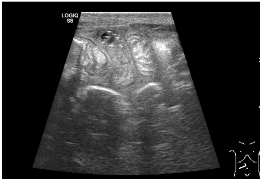
Figure 2. Ultrasonography on fourth day of admission showing oedemic pneumatized bowel