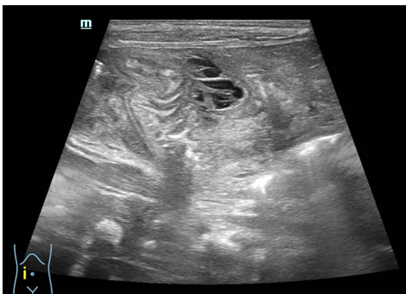
Figure 1. Ultrasonography on third day of admission showing an inflammatory mass

Newborn was transferred to the neonatal intensive care unit (NICU). Diagnosis of inflammatory lymphangioma, mesenteric cyst and necrotizing enterocolitis was considered. Abdominal X-rays showed slightly distended bowels. Parenteral nutrition was started along with antibacterial therapy of meropenem while the diagnosis of necrotizing enterocolitis was most likely. Condition remained stable until the 6th day of admission when the newborn became febrile, passed no stools, the ultrasound scan of the abdomen showed fluctuation, oedemic pneumatized bowel walls (Figure 2) while abdominal X-rays remained unremarkable (Figure 3).