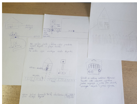
Fig. 2. Group projects ideas visualization.