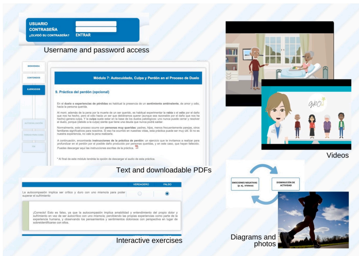
Fig. 1. “Screenshots” of the “Psychology and Technology” web platform.