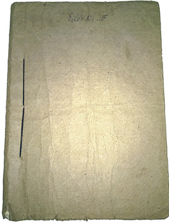
Figure 1: Cover of cultural self-published Perspektyvos (Prospects) (1978, Issue No 5)