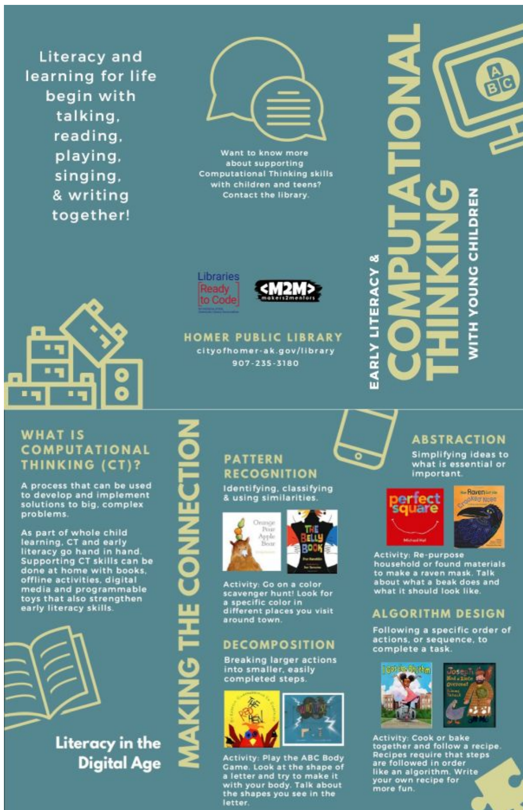
Figure 2. A CT pamphlet (retrieved with permission from https://www.ala.org/pla/initiatives/familyengagement/comptinking , accessed on 10 December 2021).