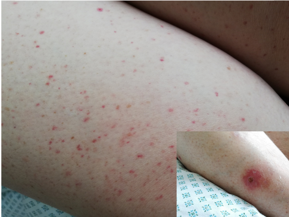
Figure 2: A palpable non-blanching purpuric rash on the right thigh and a sore with necrosis signs on the right shin.

Both of the patients gave written consent for the publication of the case report.