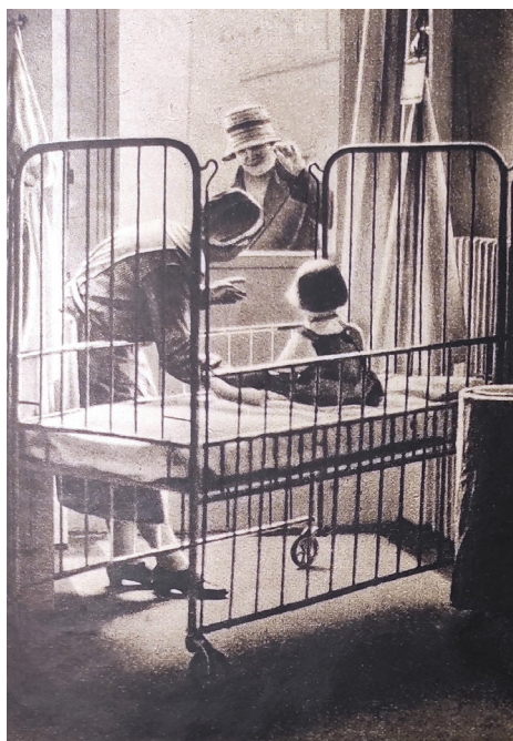
Figure 4. A closed-type hospital ward.

Issue 10 in 1937 was devoted to scarlet fever. The hygienist described all the symptoms of scarlet fever, as well as possible complications: ear infections, and heart and kidney disease. Due to the possible complications, the researcher warned that it was necessary to treat a sick child with the disease for at least