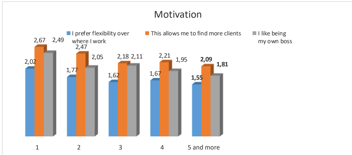
Graph 1. Motives to do the digital platform work (mean ranks) and the differences for the groups of workers using a different number of platforms

‘extremely important’, and 5 – ‘completely unimportant’. Graph 1 shows that the workers who use 5 or more platforms, compared to those who use between 1 and 4 platforms, tend to value flexibility of the platform work (mean rank 1.55), the potential to find as many customers as possible (mean rank 2.09) and being one's own boss (mean rank 1.81). Compared to the workers who use only one platform, the impact of the motivational factors on platform work is less significant.