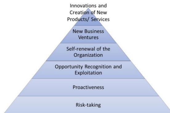
Figure 2. The Roles of an Intrapreneur