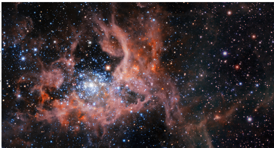
This infrared image shows the star-forming region 30 Doradus, also known as the Tarantula Nebula, highlighting its bright stars and light, pinkish clouds of hot gas. The image is a composite: it was captured by the HAWK-I instrument on ESO’s Very Large Telescope (VLT) and the Visible and Infrared Survey Telescope for Astronomy (VISTA).