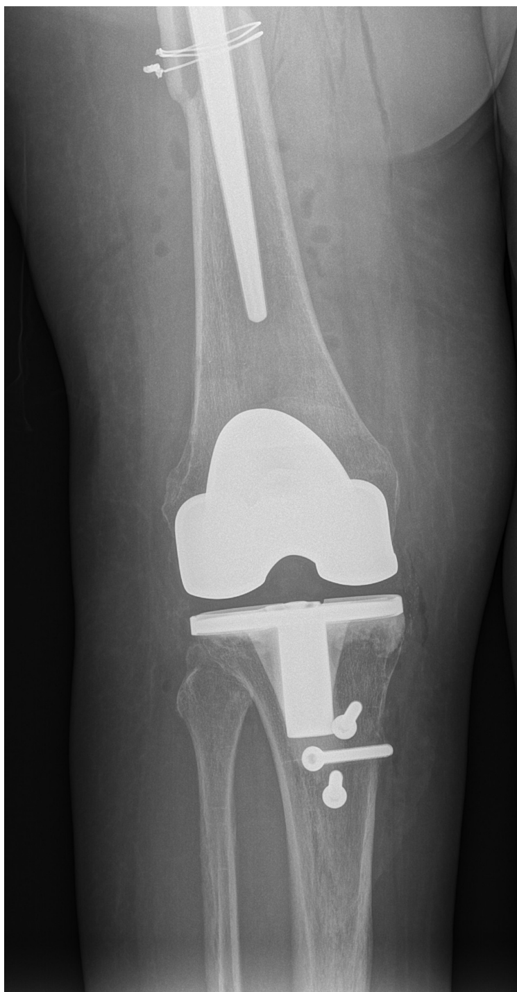
FIGURE 7: Anteroposterior X-ray of TKA and tibial tuberosity fixation