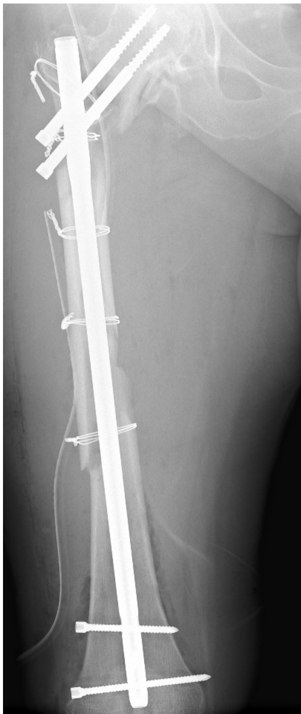
FIGURE 2: Postoperative X-ray of intramedullary osteosynthesis with a long nail

Postoperatively, the patient complained about persistent right knee pain that was not reduced by opioids. Furthermore, she was not able to bear weight or ambulate; her knee was stiff, with no movements. Careful examination of postoperative X-rays revealed a 60 x 10 mm bony fragment starting from the distal tip of the nail, going through knee joint space into the medial tibial condyle and perforating its medial cortex (Figures 3-4).