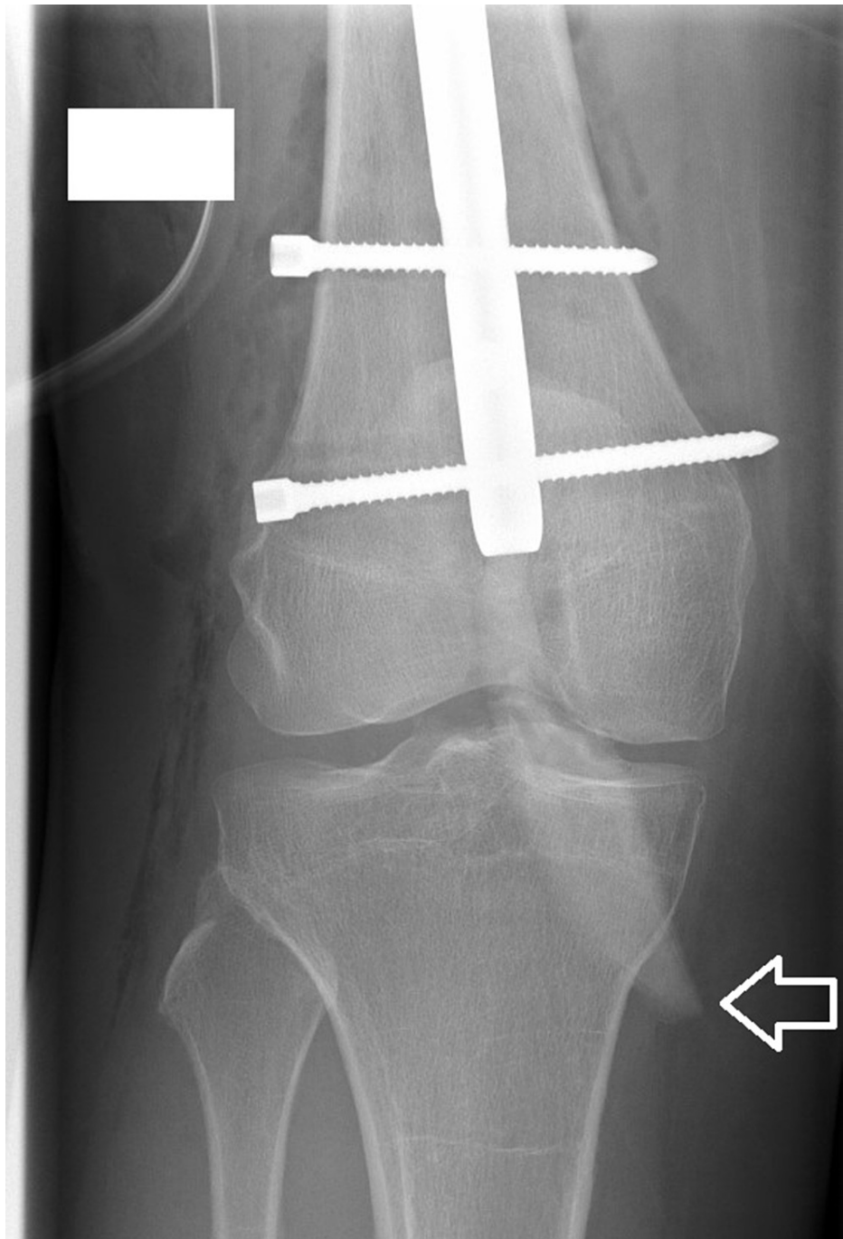
FIGURE 3: White arrow marks the intraarticular bone fragment on an anteroposterior postoperative X-ray