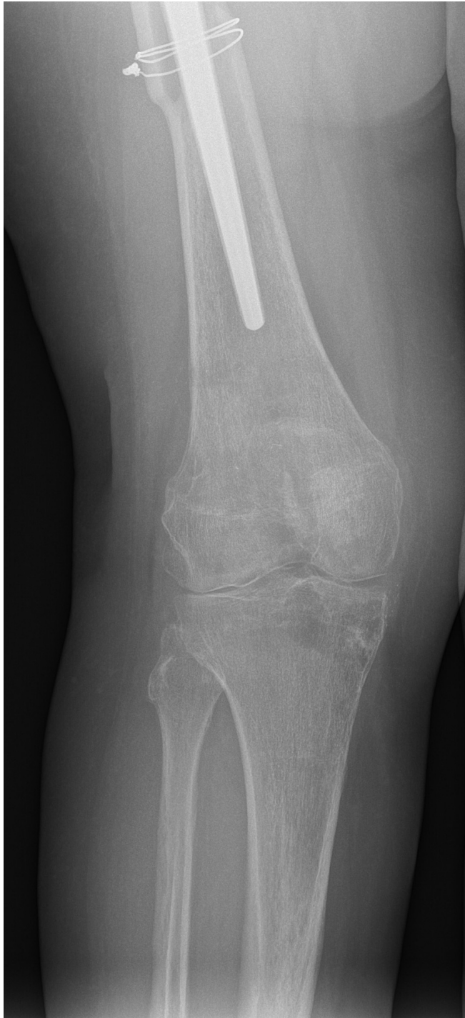
FIGURE 6: Two years after the trauma, posttraumatic gonarthrosis is present

The patient was scheduled for total knee arthroplasty (TKA). The knee joint was opened through the medial parapatellar approach. Excessive intraarticular scar tissue was found. Despite all the adhesions being removed, it was impossible to flex the knee. The decision was made to use the extensile approach with osteotomy of the tibial tuberosity. A defect of 30 percent of the size of the medial tibial condyle was present in its central part. After removal of both cruciate ligaments, a satisfactory ROM of 0/0/80 was reached with NexGen LPS (Zimmer Biomet, Warsaw, Indiana) posterior stabilized total knee prosthesis (Figures 7-8).