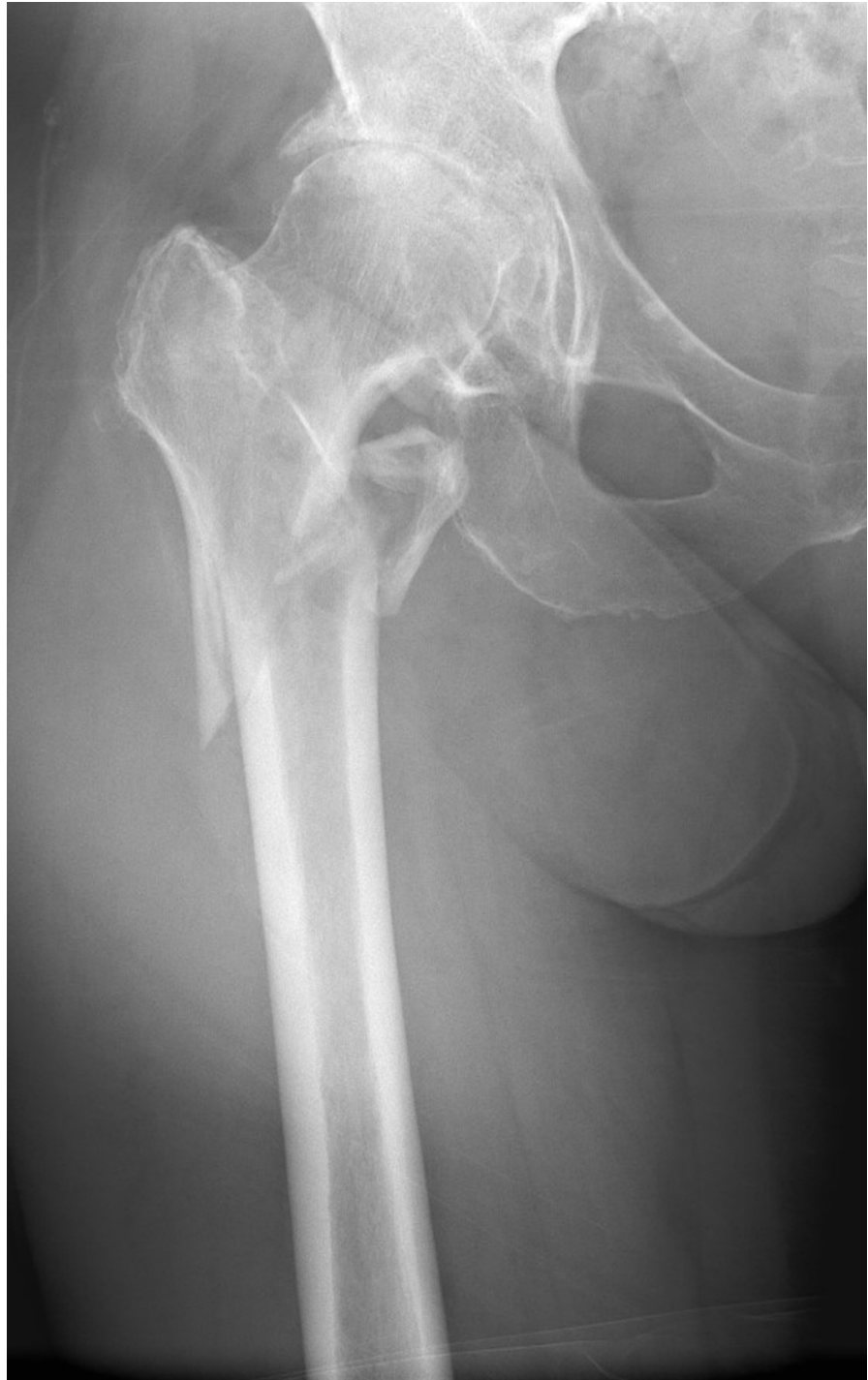
FIGURE 1: Orthopaedic Trauma Association 31 A3.3 fracture of the right proximal femur

Ipsilateral coxarthrosis was present, but it was decided to heal the fracture before joint arthroplasty. On the following day, the patient underwent closed reduction internal fixation surgery with a proximal femoral nail (PFN) on the fracture table. However, the introduction of the 12x240 mm PFN was complicated by a spiral fragmented fracture of the femoral shaft. The nail was removed, the fracture reduced in an open fashion, and held by four wire cerclages. An 11x380 mm Gama nail was used for definitive fixation; the surgery took six hours and 10 minutes (Figure 2).