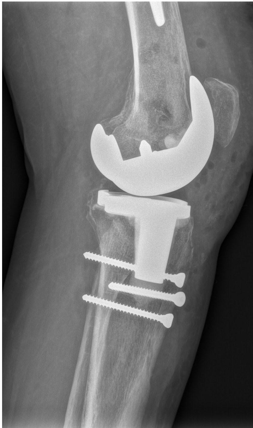
FIGURE 8: Lateral X-ray of TKA and tibial tuberosity fixation