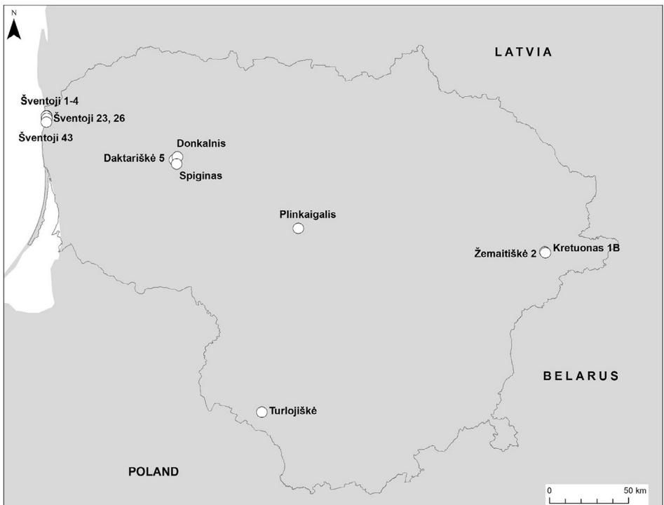
Fig. 1. Locations of the 14 prehistoric sites in Lithuania from where the samples were obtained.

These data include carbon ( \delta^{13}\text{C} ), nitrogen ( \delta^{15}\text{N} ) and sulphur ( \delta^{34}\text{S} ) stable isotope values extracted from fish and mammal bone samples. A number of taxa were sampled, including aurochs ( Bos primigenius ), domestic cattle ( Bos taurus ), common bream ( Abramis brama ), domestic dog ( Canis familiaris ), Eurasian beaver ( Castor fiber ), goat ( Capra sp.), harp seal ( Pagophilus groenlandicus ), human ( Homo sapiens ), northern pike ( Esox lucius ) and wild boar ( Sus scrofa ), representing a range of behavioural life histories and habitat uses. The specimens date to the Late Mesolithic (ca. 7000–5000 cal BC), Subneolithic (ca. 5000–2900 cal BC), Neolithic (ca. 2900–1800 cal BC), Early Bronze Age (ca. 1800–1100 cal BC) and Late Bronze Age (ca. 1100–500 cal BC). The samples were derived from 14 prehistoric sites (i.e., Daktariškė 5, Donkainis, Kretuonas 1B, Plinkaigalis, Spiginas, Šventoji 1, Šventoji 2, Šventoji 3, Šventoji 4, Šventoji 23, Šventoji 26, Šventoji 43, Turlojiškė and Žemaitiškė 2) in Lithuania (Fig. 1). The localities are represented by burial grounds, fishing stations, ritual depositions and settlement sites which have differing research histories. Excavations took place during the 20 th and 21 st centuries [see 6–11]. Samples were collected by one of us (GyP) and then submitted for isotopic analysis to the Stable Isotope