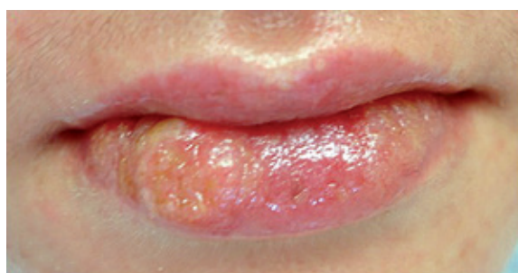
Fig. 2. Malignant transformation of oral lichen planus