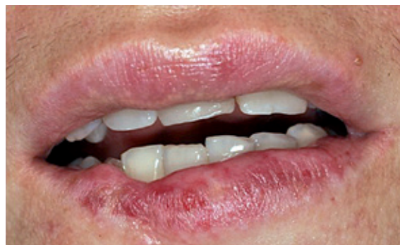
Fig. 4. The lower lip esthetic defect