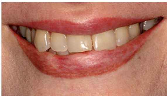
Fig. 6. Final result after multiple surgeries

but lichenoid mononuclear infiltrate still showed LP elements. Therefore, the patient needed a regular professional monitoring of oral and general health. Figure 6 presents the patient's photo after multiple surgeries. The patient was informed that the lesion may reoccur.