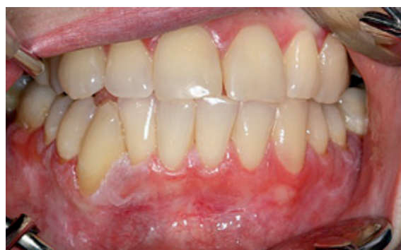
Fig. 5. Lichen planus manifestations