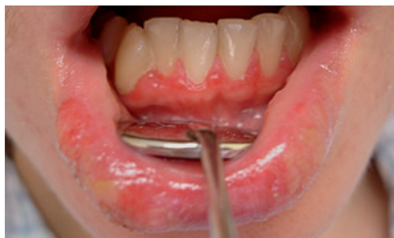
Fig. 1. Erosive lichen planus manifestations and desquamative gingivitis