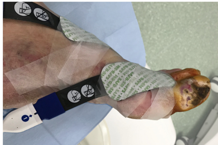
Figure 1. NIRS sensor placement near the ischemic wound.

After every procedure, the NIRS data was downloaded and post-processed using Excel v16.42, Microsoft (Redmond, WA, USA). Afterwards, the means of the first and last 50 measurements of every sensor were calculated. The formula below was used to measure the revascularization effect.