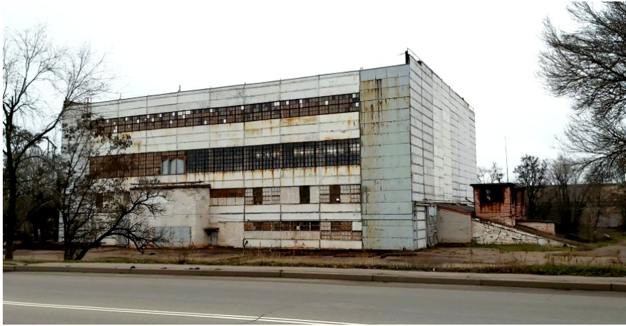
Figure 4. External view of the underground mine “Artem-2”.

“Artem-2” is unique, even within Kryvyi Rih because ore was transported on the daylight surface not by the traditional vertical skip mechanism, but by two belt conveyors installed in inclined (not vertical) shafts (figure 5). In addition to them, the deposit named after Kirov was also opened by a number of vertical shafts.