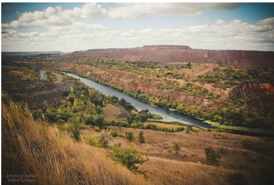
Figure 2. The canal of the Inhulets River and panorama of man-made landscapes from the Burshchytsky dump.