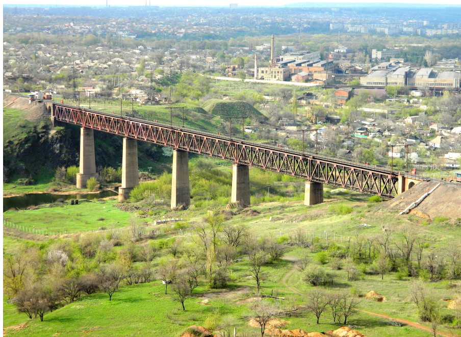
Figure 3. Panorama of Beleliubskiy bridge and the city from the Burshchytskyi dump.

In the immediate vicinity of the dump there are several objects of industrial heritage: the ruins of surface facilities of underground mines No. 5 Nova and Valiavka-Pivdenna of the former Ilyich mine administration (built in the 1950s); open shafts of these mines that go as deep as 60 and 380 meters respectively.