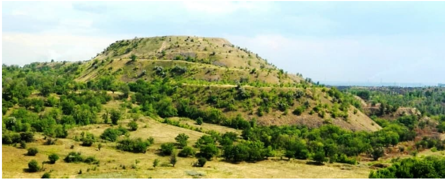
Figure 1. The Burshchytsky dump.