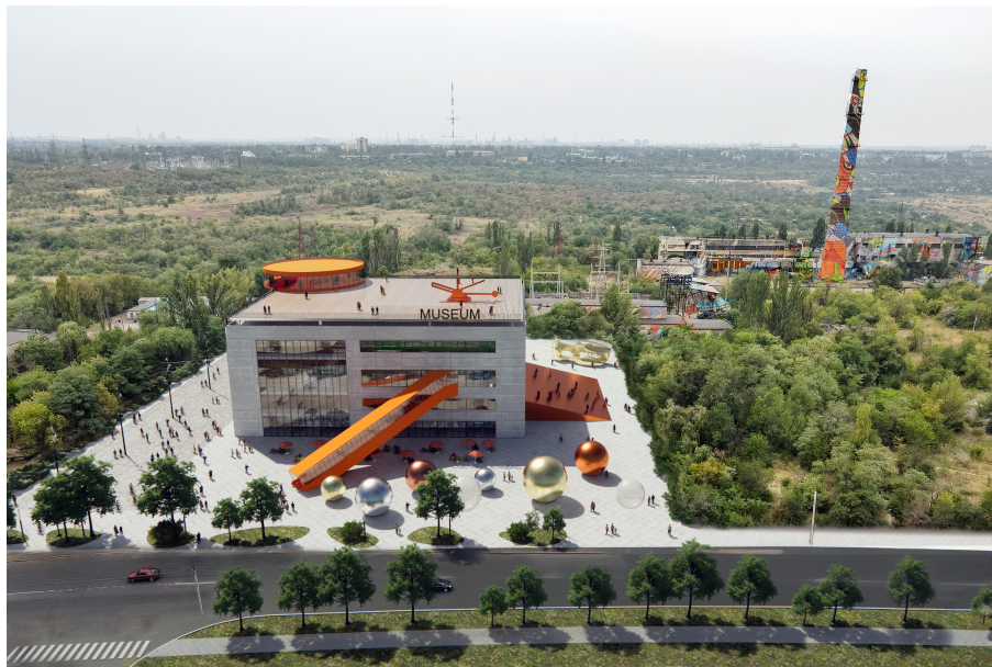
Figure 6. Project of creating an interactive industrial museum and scientific and educational Experimentarium [20].