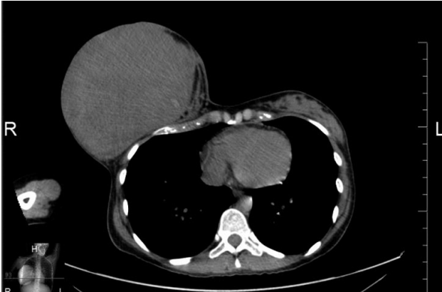
Figure 2. Chest CT scan

Chest and abdominal CT scan with ultravist 300 examination: right breast dimensions 174 \, \mathrm{mm} \times 123 \, \mathrm{mm} \times 166 \, \mathrm{mm} round shape, well-defined margins, heterogeneous internal structure, consisting of lobules with blood perfusion and cavities of tissue destruction. Tumor without signs of invasion to the chest wall and axillary, supraclavicular and infraclavicular lymph nodes. Chest and abdomen CT scan – without pathology (Figure 2). Differentiate with tumor phyllodes and angiosarcoma.