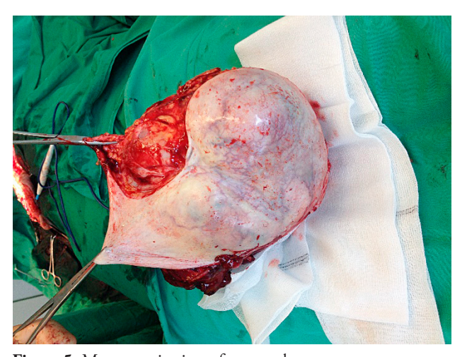
Figure 5. Macroscopic view of removed tumor