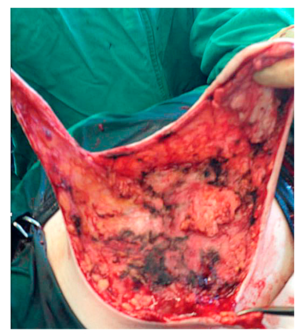
Figure 3. Nipple-sparing mastectomy: dissection

Surgical treatment. Patient underwent nipple-sparing mastectomy, removing breast with tumor with 1–2 cm circle margin of normal-appearing breast tissues (Fig. 3 and 4). Urgent retroareolar and margins pathologic (frozen section) examination did not revealed tumor.