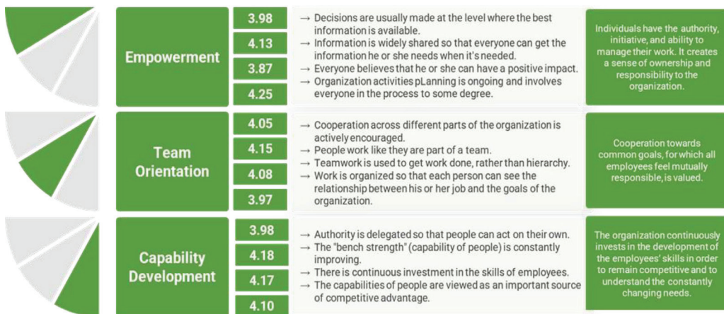
Figure 3 Each of 12 Item Scores of the Involvement Trait

In order to assess differences in organizational culture between different sociodemographic groups of employees of educational institutions, the scores of the involvement trait were compared between teachers and school heads, their age, type of organization, number of employees, length of service, and other groups.