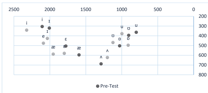
Figure 1. Pre-test vowel quality of EG and CG

Vowel /æ/ can be distinguished from sound /e/ more so by backness than height of the tongue position. Traditionally, F1 for these sounds is similar frequenting at around 580Hz-588Hz, yet /æ/ is produced more in the front, than /e/. Pre-test results show that F2 for these vowel sounds was very close ranging between 1594Hz and 1757Hz for /æ/, while /e/ saw ranges of 1737Hz and 1777Hz. Russian speakers producing /æ/ sound more in the back found themselves pronouncing it more like /e/ (see Figure 1 with vertical axis representing F1 measurements, which corresponds to tongue height, and horizontal axis representing F2 measurements, which corresponds to tongue advancement.)