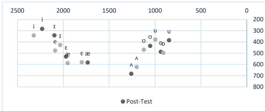
Figure 2. Post-test vowel quality of EG and CG

After using Duolingo for a month, noticeable differences emerged in the EG pronunciation. For example, the F1 value for /i/ was 283Hz and for /ɪ/ it was around 350Hz. The pair /u/ and /ʊ/ saw F1 frequencies of approximately 385Hz and 435Hz, respectively. The backness for /u/ and /ʊ/ also improved, with F2 values of 847Hz for /u/ and 1053Hz for /ʊ/. These changes were not observed in the CG. However, /æ/ did not show significant improvement, remaining close to /e/. The CG showed less significant changes in vowel duration, with pre-test and post-test ratios remaining similar (see Figure 2).