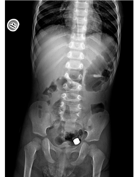
Figure 3. Abdominal radiograph of a one and a half year old boy shows 2 connected magnetic beads located in the colon

Although some authors claim that an emergency explorative laparotomy to remove the magnetic foreign bodies and necessary repairs should be performed as soon as multiple magnets have passed beyond the pylorus in cases they cannot be retracted [8, 16–18], the NAPSGHAN algorithm suggests a different approach. According to this algorithm, surgical intervention is suggested in cases of symptomatic patients with multiple magnets beyond the stomach and in cases of asymptomatic patients when no progression on serial X-rays is seen. However, there is no place in this algorithm for multiple magnets which are separated along their course in the gastrointestinal tract or when separation occurs on follow-up serial x-rays. In such cases, the potential of contraction of opposing magnets occurs and laparoscopy should be recommended as the first option for exploration [19].