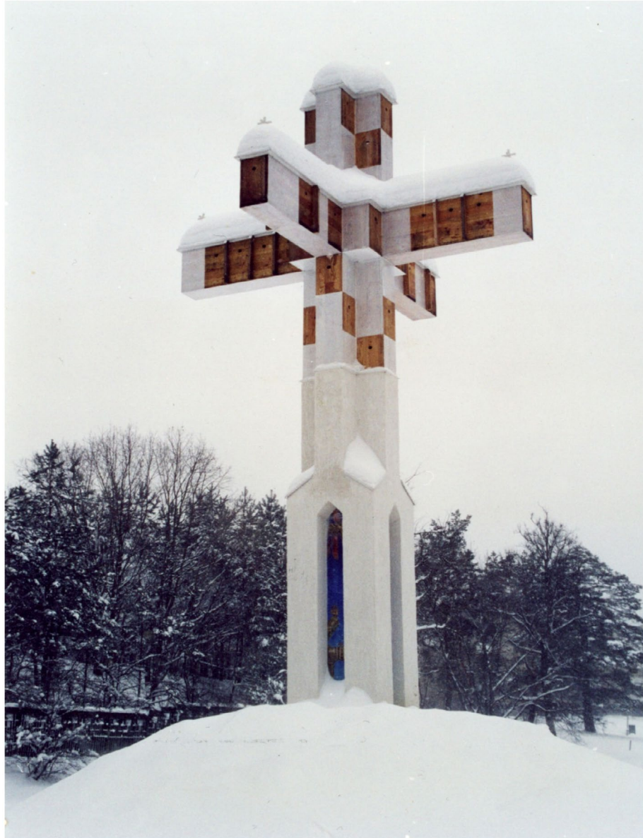
Figure 5. Gitenis Umbrasas. Chirping Cross . 2001. Latvian street in Vilnius.

marketplace of art and opinion that are modulated by publicity campaigns and surveys” (Guattari, 1996, p. 111).