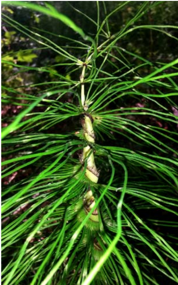
Fig. 2. Apical part of Equisetum telmateia stem with spirally arranged sheath and branches in the population of Rusių Ragas, 2016

logical transformation can be caused by the influence of external factors (low temperature, mechanical injuries, microorganism actions, etc.) during the early stages of the shoot development rather than with the action of genes (WRÓBEL, 2003). Our supposition is based on the fact that only solitary shoots had spirally arranged branches, whereas other shoots of the same clone were developed normally.