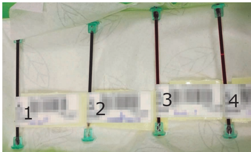
Figure 2. Markedly darker discoloration of blood compared with healthy controls (1, patient; 2, patient's mother; 3, 4, healthy controls).