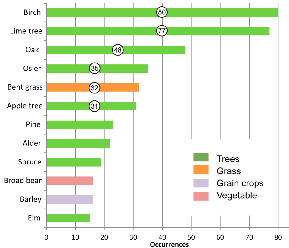
Figure 1. The most frequent names of plants in the oikonyms of Lithuania.

Arklėnai , though immediately associated with arklys ('horse') is, most likely derived from this word indirectly, via a personal name that means a man who is strong and sturdy as a horse. The oikonym Bitėnai derives from the personal name Bitėnas that originates from bitė ('bee'). Such oikonyms were not included in our database in cases of reliable evidence of transnimation. As the identification of the actual local origin of each individual toponym is a resource-consuming and sometimes utterly impossible task, we decided to include all the oikonyms that could have been derived from the names of plants, fungi and animals even though their origin is arguable and incapable of demonstration. Being aware of that, users are encouraged to suggest alternative explanations. We expect to receive readers' negations of the claimed zoo-botanical origin of some names. That would demonstrate the interest of users in the dataset and maps. The web application provides the tools for users to submit their comments regarding individual names. If the dataset is maintained as planned, the number of false attributions will gradually decrease.