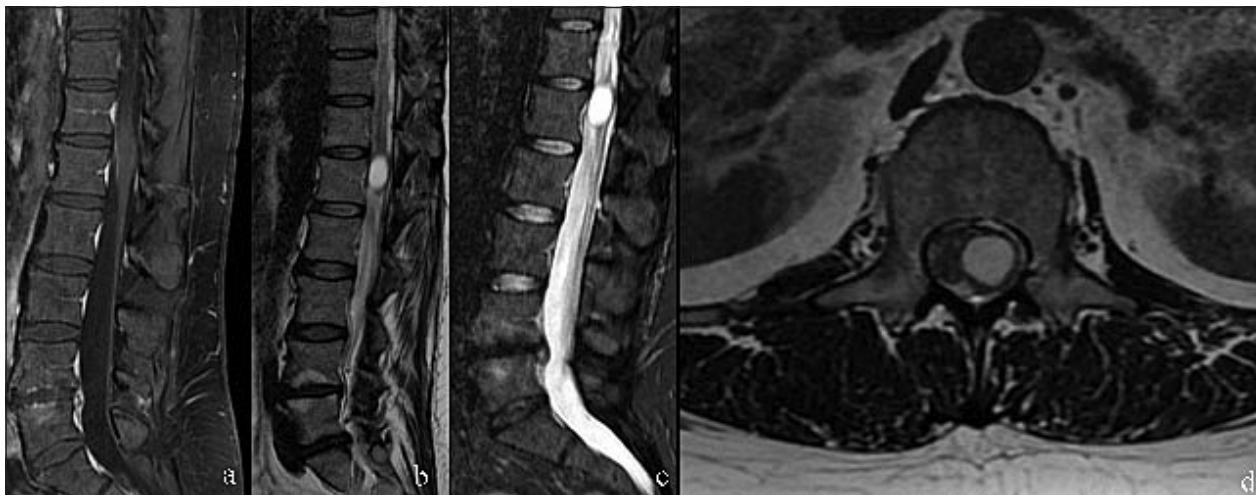
Fig. 1. Lumbar spine MRI

a, b - T2 sagittal and axial plane showed well delineated cystic lesion; c - T2 TIRM sequence showed no intralésional fat; d - T1 sequence with fat suppression after contrast admission showed no contrast enhancement in the lesion