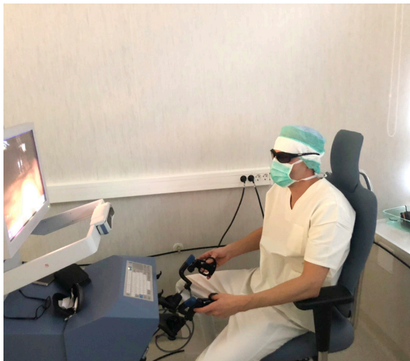
Figure 3. Surgeon works at console