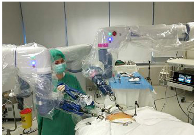
Figure 1. Docking of robotic arms

The robotic-assisted operations were performed with the Senhance system (TransEnterix, Inc., Morrisville, NC, USA). We participated in a 4-day intensive training program with this system at the European training center of TransEnterix Inc. in Milan. Surgeons and nurses of our team were able to use the robot over several hours. The training was concluded with procedural performances in an animal model, a test, and a certificate being