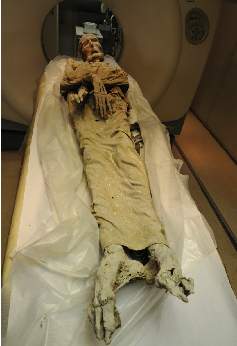
Fig. 3. One of the Palermo mummies during a CT investigation carried out in situ via a portable unit, Italy.

3 pav. Viena iš Palermo mumijų kompiuterinės tomografijos tyrimo, atlikto vietoje kilnojamo prietaisu, metu, Italija