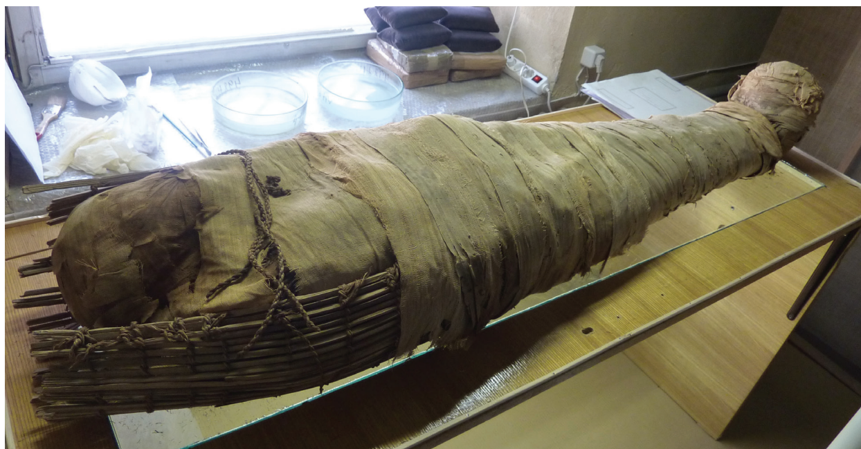
Fig. 10. The Kaunas mummy during conservation works at Vilnius. Once believed to be those of a woman, the remains actually belonged to a man of lower social status, Lithuania.

9 pav. Viena iš 23 mumijų, rastų Vilniaus Dominikonų bažnyčios rūsiuose, Lietuva