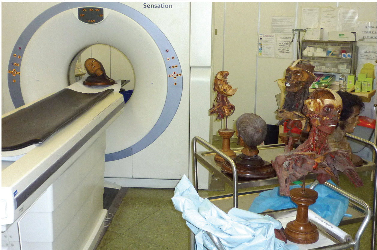
Fig. 8. The medical mummies produced by Giovan Battista Rini during the CT investigation at the Desenzano-Lonato Hospital, Italy.

8 pav. Giovano Battistos Rini medicininės mumijos kompiuterinės tomografijos tyrimo metu Italijos Desenzano-Lonato ligoninėje, Italija