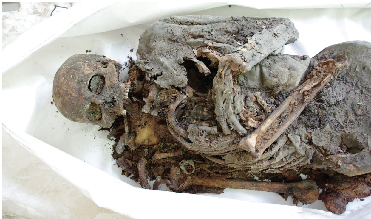
Fig. 9. One of the 23 mummies recovered from the crypt of the Dominican Church at Vilnius, Lithuania.

9 pav. Viena iš 23 mumijų, rastų Vilniaus Dominikonų bažnyčios rūsiuose, Lietuva