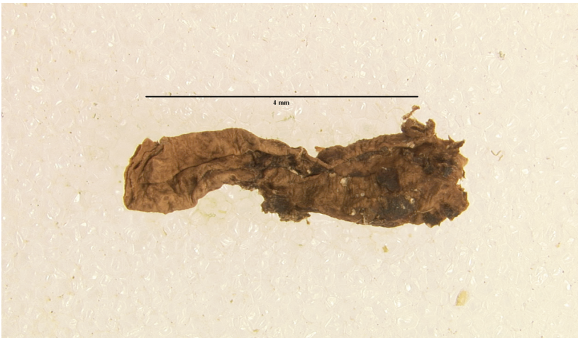
Fig. 5. Analyses of a coprolite associated with a mummy at Piraino revealed the presence of what appears to be a fragment of animal intestine, USA.