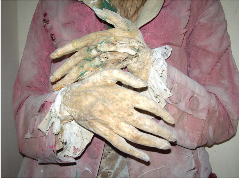
Figure 2. The beautifully preserved hands of one of the Savoca mummies that were investigated within the framework of the Sicily Mummy Project, Italy.

2 pav. Vienos iš Savokos mumijų, tirtų įgyvendinant Sicilijos mumijų projektą, puikiai išlikusios rankos, Italija