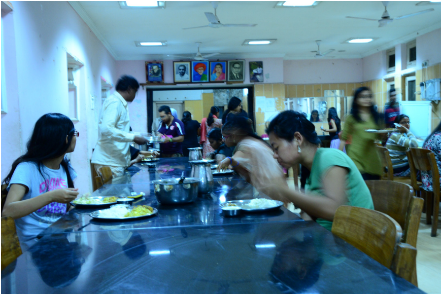
Dalit-Bahujan icons in women's canteen at EFLU