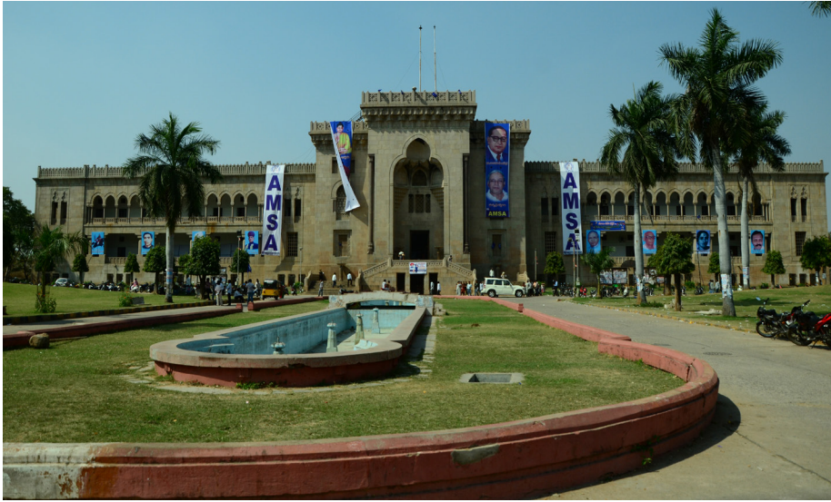
The Arts College Building of Osmania University with Dalit Political Posters

Besides these two blocks, Dalits and leftists, there was a group of Telangana organizations that were largely pre-occupied with the Telangana movement, and in a way had mixed political identities, ranging from Left to Dalit leaning. Dalit students were especially articulate in the Telangana agitation, creating an impression that the Telangana movement was majorly led by Dalit and other subaltern students. During the fieldwork, the Telangana cause was one of the most significant resources upon which the Dalit student activists built up their repertoire of contention. In 2014, the campus public space seemed to be in the grip of Dalit student activism. The Arts College building every now and then would display huge building-size posters with pictures of Dalits and other lower-castes' historical icons and political leaders—Buddha, Ambedkar, Phule, Kanshi Ram and others.