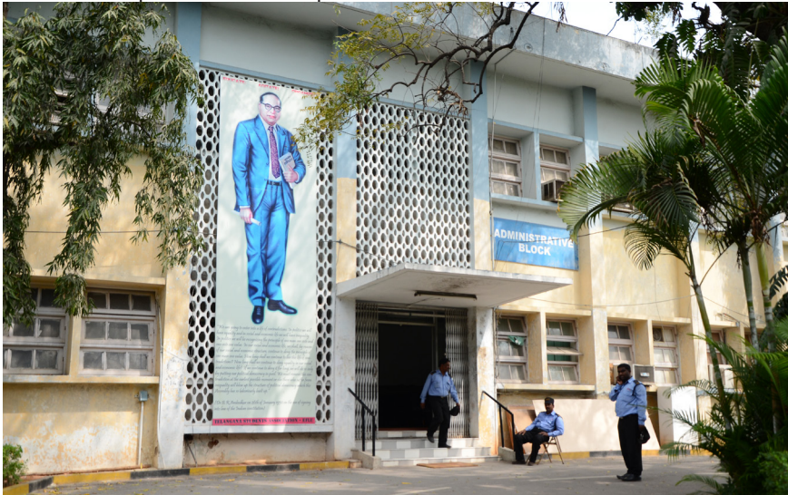
Poster with the image of Ambedkar at the entrance to EFLU's administration building

While the strength of Dalit student activism on the Osmania campus might be attributed to successful mobilization of local Telugu students formerly exposed to radical left politics, in the EFLU campus Dalit activism managed to successfully outreach other non-Dalit student groups, simultaneously evolving into the broader counter-culture movement that, during the time of my fieldwork, was the most visible form of student politics in the campus.