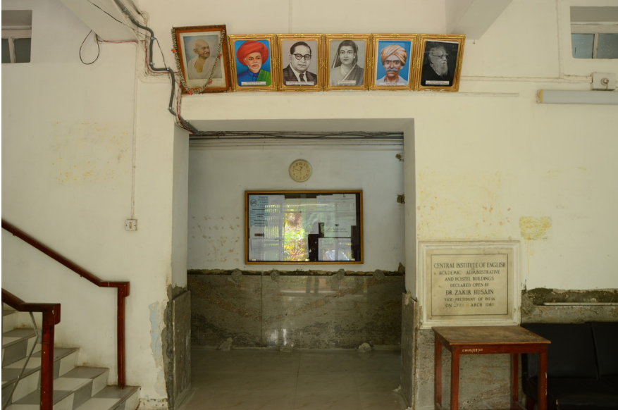
Dalit-Bahujan icons and Gandhi inside EFLU's administration building