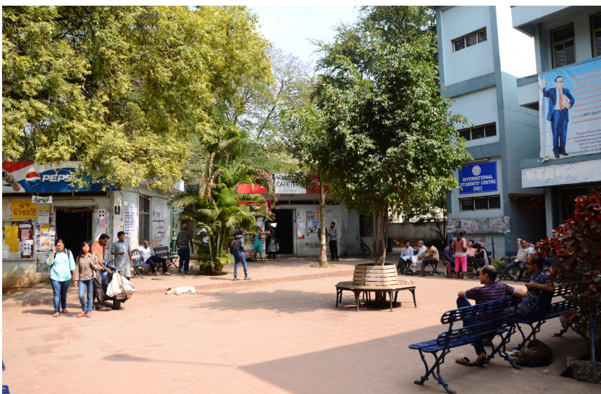
Poster with Ambedkar's image at Sagar square at EFLU