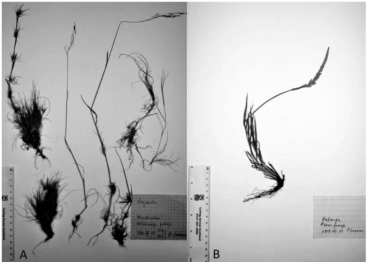
Fig. 1. Atypical Poaceae specimens collected by P. Snarskis: not fully identified (A) and unidentified specimens (B)

ent species were found placed together in six herbarium sheets (Table 1). Only one specimen, Koeleria gracilis Pers., in the analysed collection was identified to species level by P. Snarskis. In 47 herbarium sheets, P. Snarskis identified the plants to level of genus: Koeleria (23), Agrostis (10), Calamagrostis Adans. (four), Poa L. (three), Alopecurus L. (two), Bromus L. (two), Festuca L. (two), and Lolium L. (one). In 13 herbarium sheets, specimens were left unidentified.