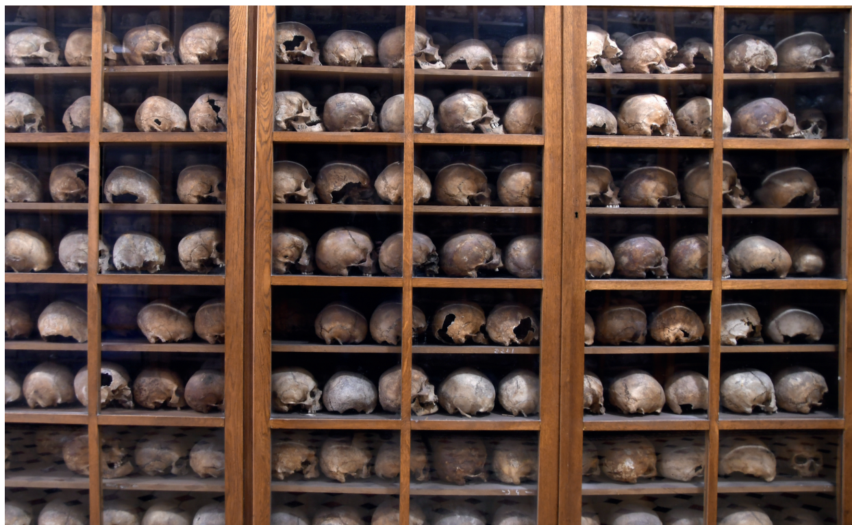
Fig. 6. Skull collection from the 19 th century.

6 pav. XIX a. kaukolių kolekcija.