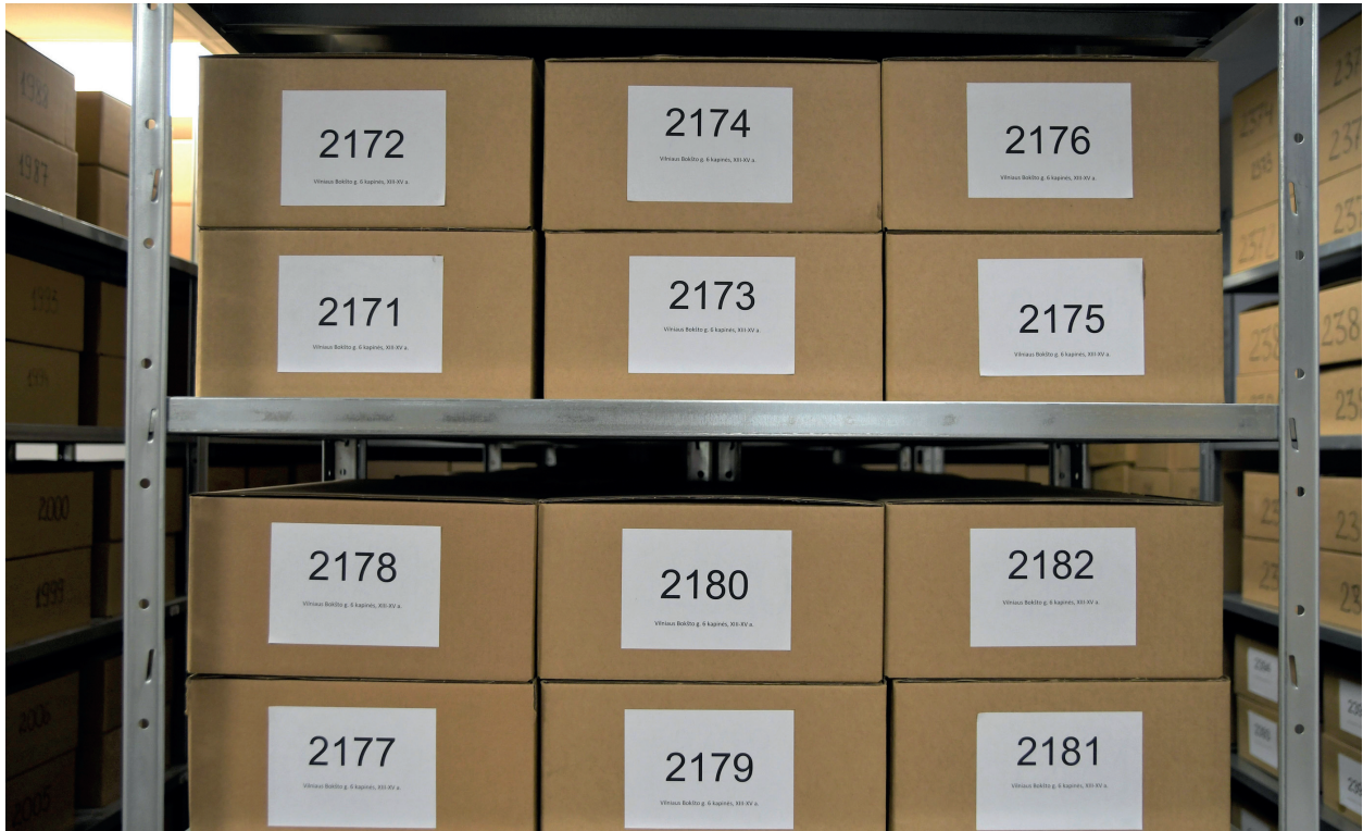
Fig. 5. Postcranial skeletal collection.

5 pav. Postkranijinių skeletų kolekcija.