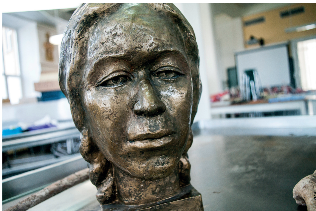
Fig. 4. Reconstruction of a Neolithic woman buried together with a fetus. Photo by Daumantas Liekis.

3 pav. Profesorius Pavilionis (kairėje) ir SSRS sveikatos apsaugos ministras Borisas Petrovskis su žmona Anatomijos, histologijos ir embriologijos katedroje. Antrame plane matyti kaukolių spintos, uždangstytos evoliucijos plakatais. VU MF nuotr.