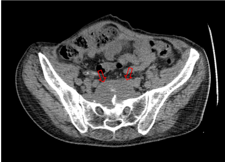
Fig. 1. Transverse CT image showing deep pelvic abscess located at presacral region before drainage (red arrows).