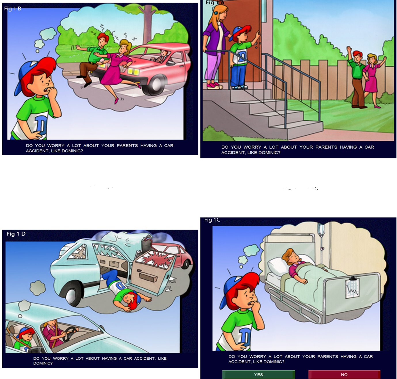
Fig 1. Pictures and text illustrating DI survey questions. (A-C) accompany, “Do you worry a lot about your parents having a car accident, like Dominic?”, whereas (D) accompanies the question, “Do you worry a lot about having a car accident, like Dominic?”. Reprinted from the Dominic Interactive under a CC BY license, with permission from DIMAT.

https://doi.org/10.1371/journal.pone.0181619.g001