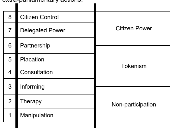
Fig. 1. Arnstein's ladder of citizen participation.

Citizens' civic participation is any individual or group activity addressing issues of public concern. Voluntary work and participation in associations are typical examples of civic participation. As civic participation activities are denotations, local community's activities as environment cleaning, communication with municipality stakeholders regarding the new ideas or city problems, etc. According to Ekman and Amnå (2009) sometimes civil participation could be described as latent political participation, because "latently" it has relation to specific political parliamentary and extra-parliamentary actions.